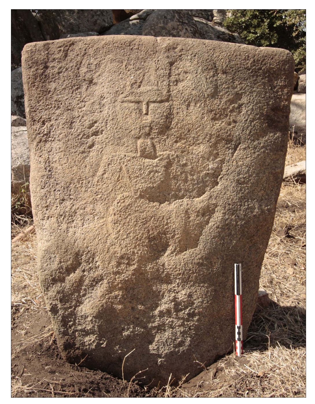
Figure 1. Engraved stela.