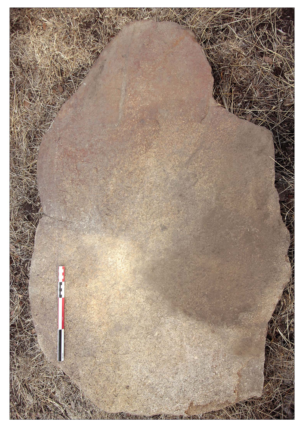
Figure 5. Non-engraved stela model with exposed 'head' area.