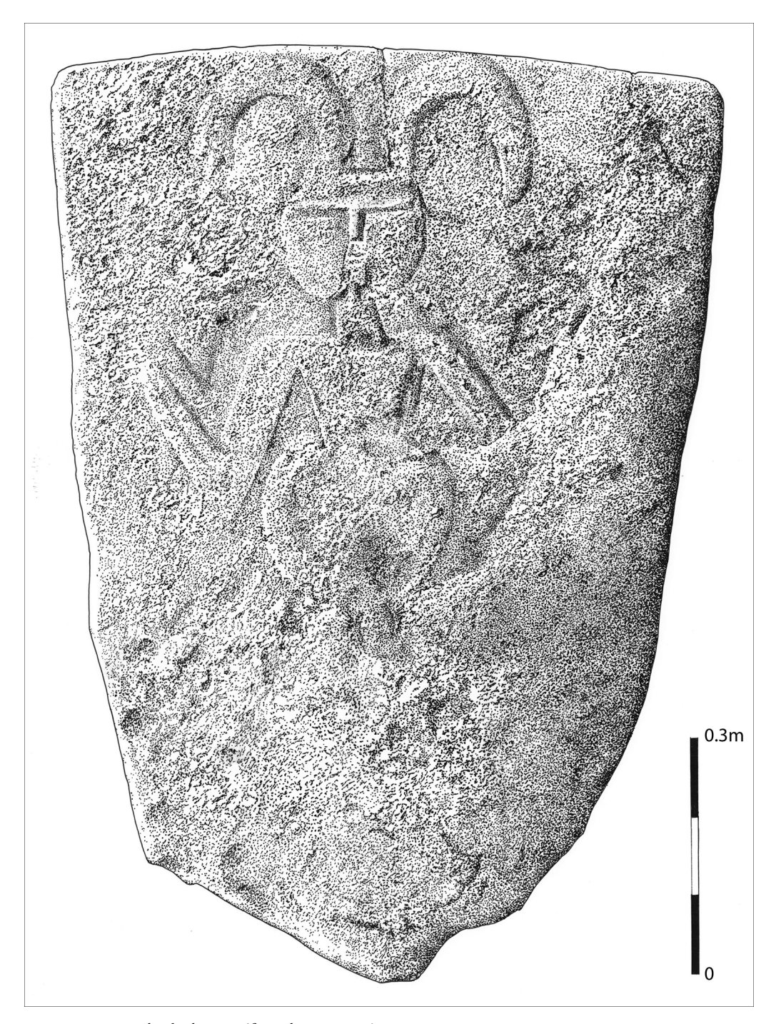
Figure 2. Engraved stela drawing (figure by R. Picavet).